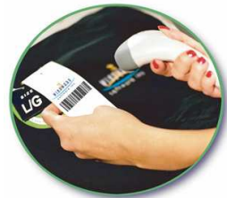
All items tracked real-time to allow your website to display accurate inventory