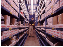
Individual SKU receipt and storage