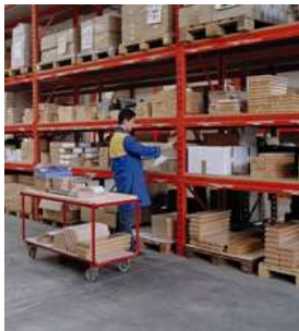
Bulk pick and process or individual order pick and pack