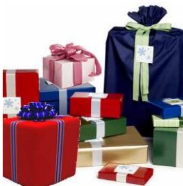
Custom Kitting, gift-wrap, and packaging options.